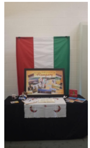
We added an 8 foot flag to our display table.

August leads us into busy 5 months of meetings. We have them scattered across the east coast and mid-west. Please continue to pray for churches to hear the need and respond to the need for the Gospel in Hungary. I was just there the end of June for a visit and met a man who traveled for 2.5 hours by train and bus to go to church because where he lives, there is none closer. He lives in a city of about 100 thousand people and there is no Gospel preaching church there. Many churches have joined us lately and we praise God for them. We have about 130 more churches to present in at the pace we are going, however, I believe that we have already presented in enough to be on the field. We thank the Lord for your prayers.