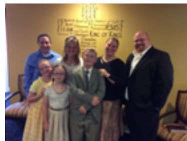
Friends in Hamburg, NY