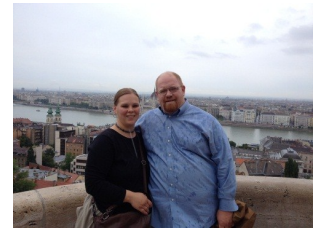
Overlooking Budapest from the Castle District